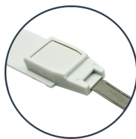
One Way Entry