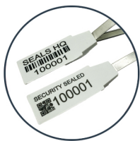
Plastic Marking Flap